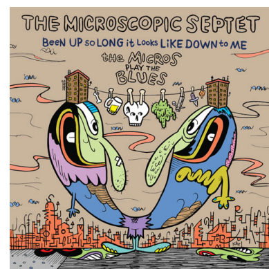
The Microscopic Septet Been Up So Long It Looks Like Down to Me: The Micros Play the Blues (Cuneiform Rune 425)